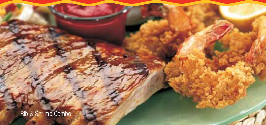
Rib & Shrimp Combo