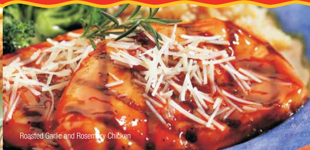
Roasted Garlic and Rosemary Chicken